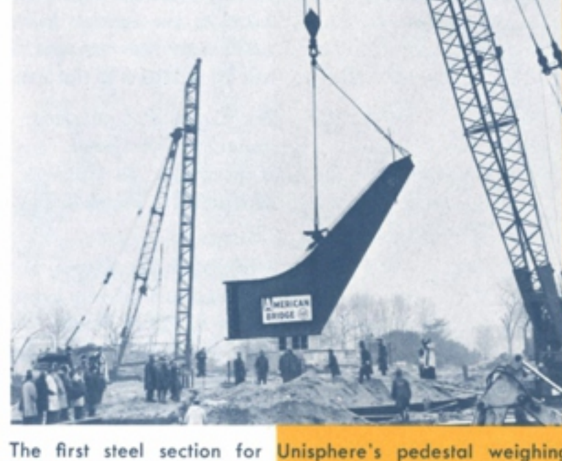
The first steel section for Unisphere's pedestal weighing twenty tons, is lowered into place. Fabrication of sections for the world's largest representation of the Earth is taking place in Harrisburg, Pa., at U.S. Steel's American Bridge Division, and from there will be shipped by rail and truck to Flushing Meadow Park.

And so we discarded startling abstractions and decided on a transparent, or shall I say diaphanous globe with orbits, with the continents outlined, and ingenious lighting and other effects in place of revolving machinery. What stronger, more durable, and more appropriate metal could be thought of than stainless steel? And what builder