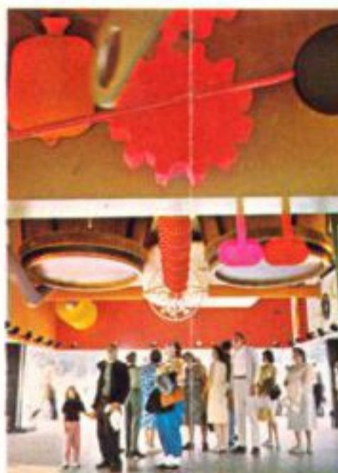
Inside the Chrysler "engine"