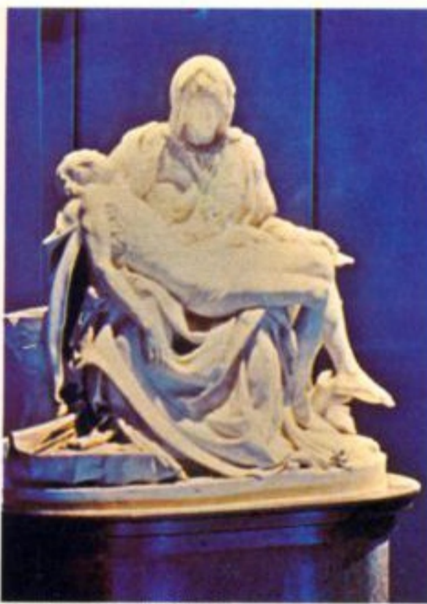
The "Pieta" at the Vatican pavilion