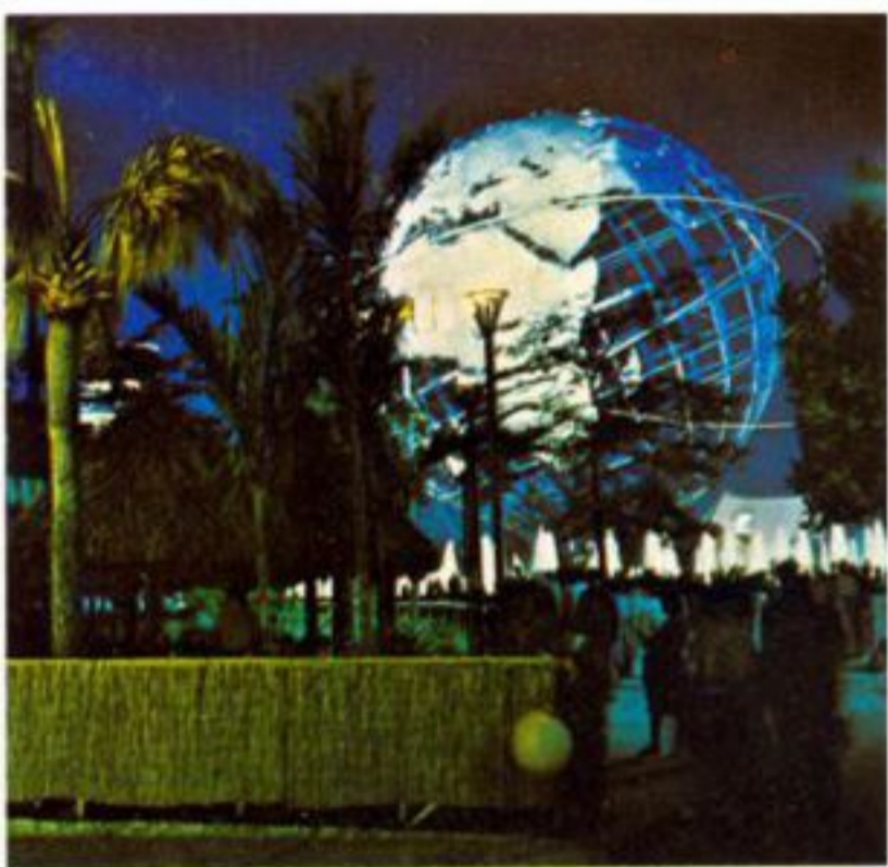
United Nations Secretariat Building • United States Steel • © 1965 New York World's Fair, Inc. All Rights Reserved