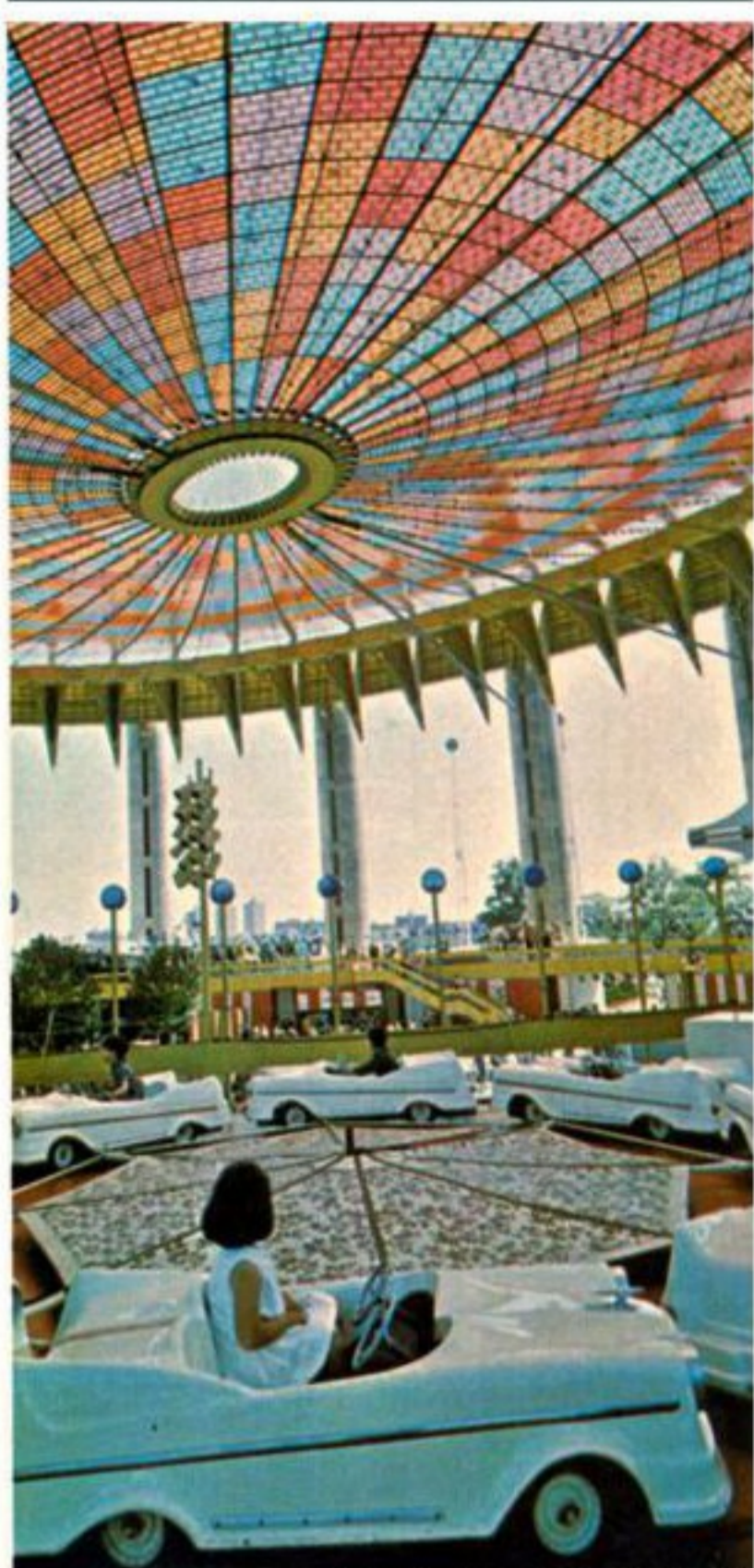
Fun at the New York State Pavilion