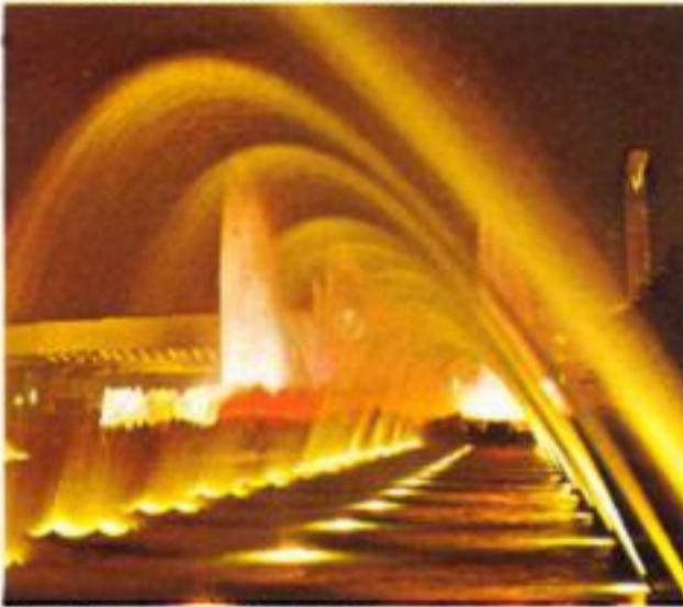
The Promenade fountains