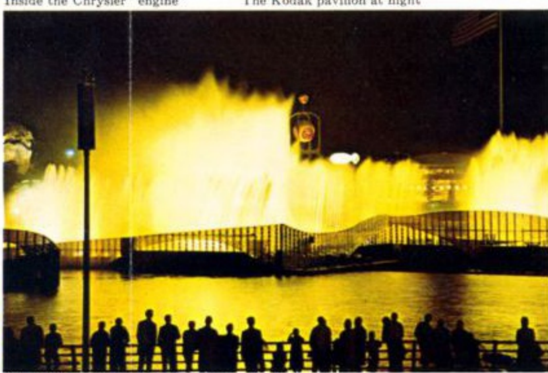
Colorful fountains and fireworks every night at 9