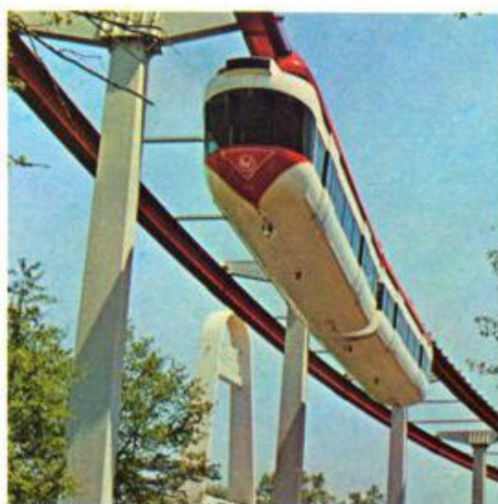
AMF's Monorail circles over the Fair