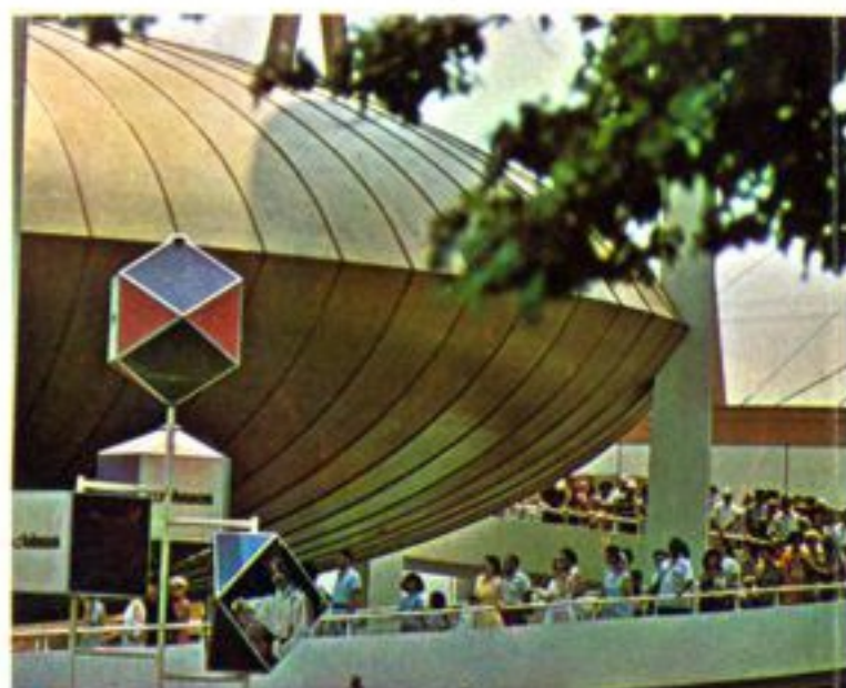
Johnson's Wax suspended theatre