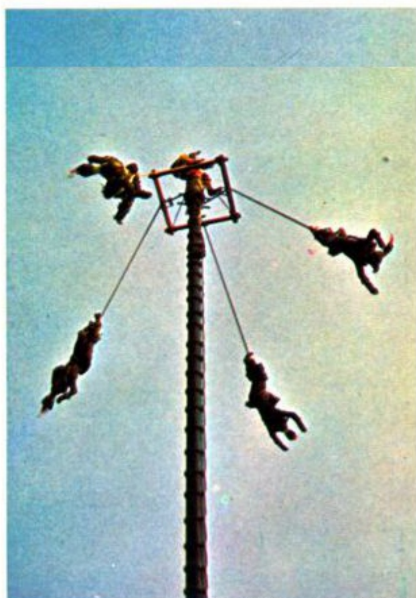
Mexico's "Flying Eagles of Papantla"