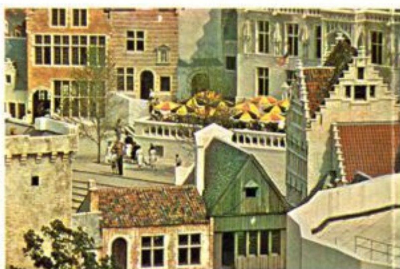
The charming Belgian Village