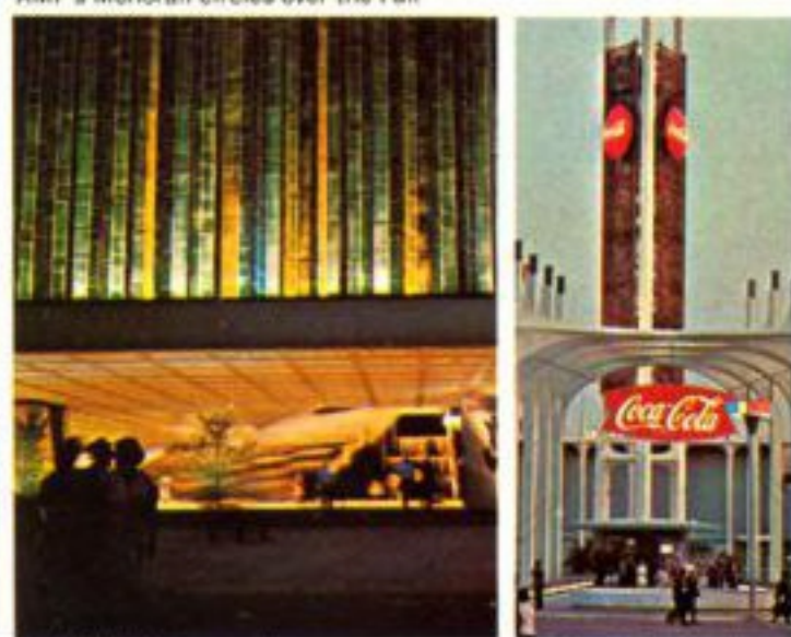
The United States pavilion