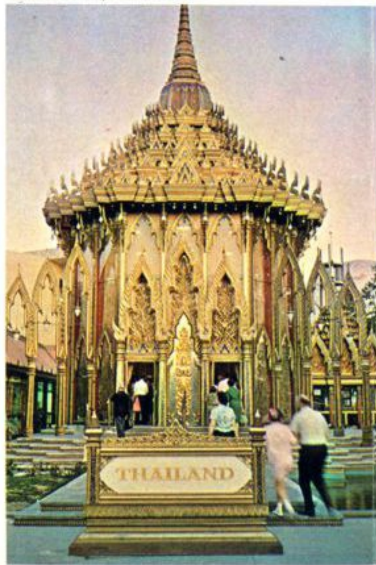
Thailand's exotic "Temple of Dawn"