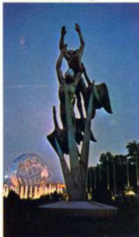
A sculpture garden