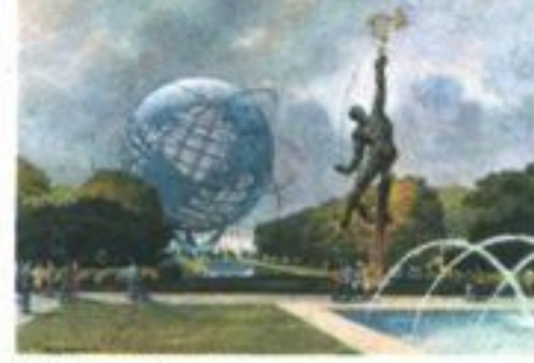
VIEW OF CENTRAL MALL

HOUSING For information on hotel and motel accommodations in and near New York City, write: New York World's Fair Housing Bureau P.O. Box 1964 - Radio City Station New York 19, N. Y. Telephone: 212-Circle 7-0100