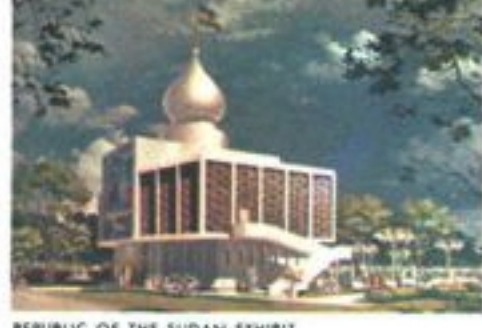
REPUBLIC OF THE SUDAN EXHIBIT