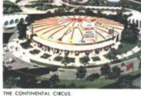
THE CONTINENTAL CIRCUS

...An exciting panorama of exhibits and shows from around the globe... with more than 70 countries, 200 major industries, Federal and State pavilions... Fun for a day or a month... for all the family!