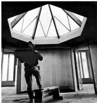
The Reception Desk and Sales Area will be placed under this dome in the Reading Room Building.