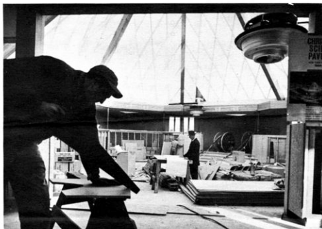
The interior of the exhibit building as it appeared early in February with workmen speeding installation of partitions and finishing touches.