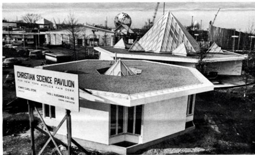
Looking toward the Unisphere from the Christian Science Reading Room and Main Exhibit Building.