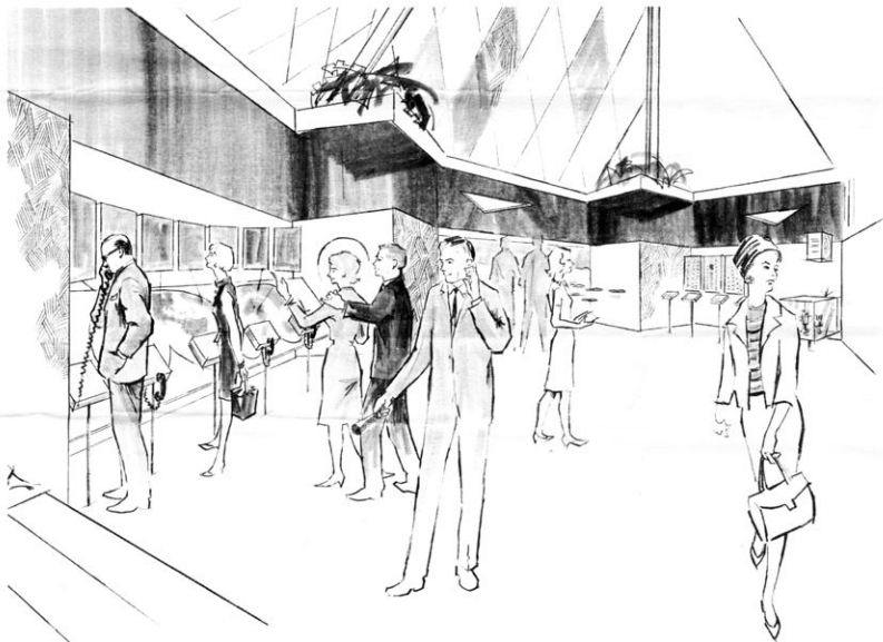
An artist's rendering of the view that will greet visitors when they arrive at the Christian Science Pavilion.