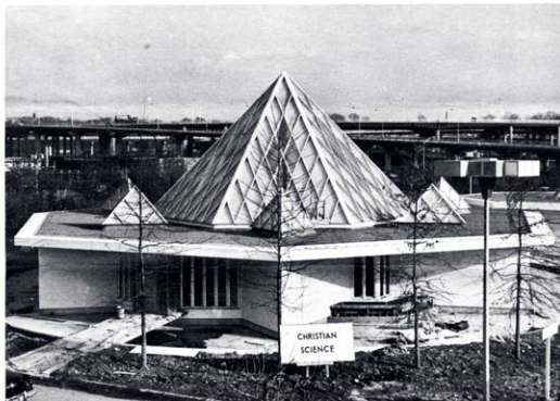
This photo taken early February shows the Christian Science Pavilion nearing completion, with painting, final landscaping, and fountain installations under way. At the rear exit will be Meditation Walk. The Long Island Expressway is seen in the background.