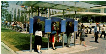
All the 1,400 public telephones are the modern TOUCH-TONE push-button models, which make calling a faster, more convenient experience. Be sure to try this exciting new way of telephoning.

In addition, handy information centers are located throughout the fairgrounds and are staffed with specially trained personnel, many of whom speak several languages.