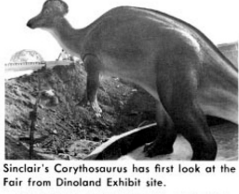
Sinclair's Corythosaurus has first look at the Fair from Dinoland Exhibit site.

UNISPHERE® presented by United States Steel © 1963 New York World's Fair 1964-1965 Corporation