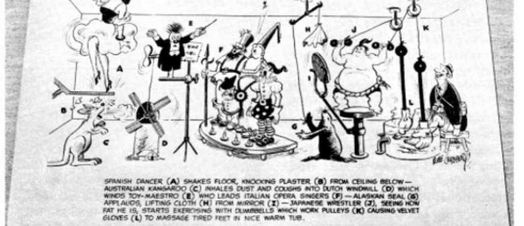
An original Rube Goldberg drawing located in the Terrace Club of the Port Authority Building.