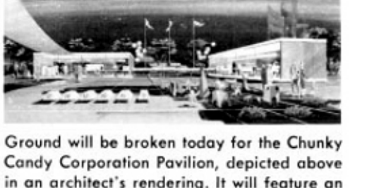
Ground will be broken today for the Chunky Candy Corporation pavilion, depicted above in an architect's rendering. It will feature an unusual outdoor sculpture group called a "continuum" and an ultra-modern candy factory. Chunky is the only candy company which will have its own separate exhibit at the Fair.